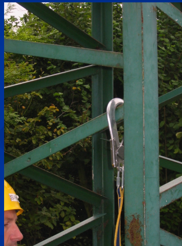
Do not let the scaffolds slip