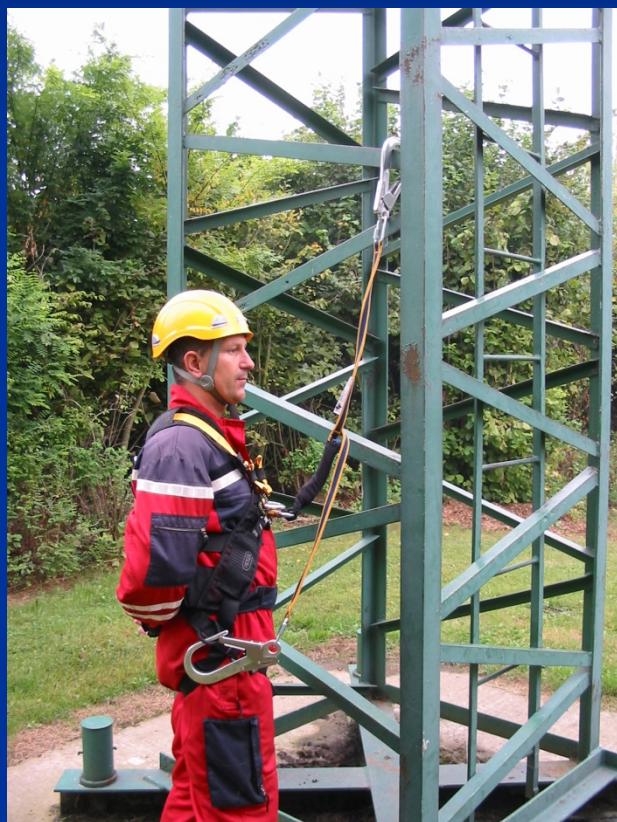
Do not fasten free scaffolds at the body.