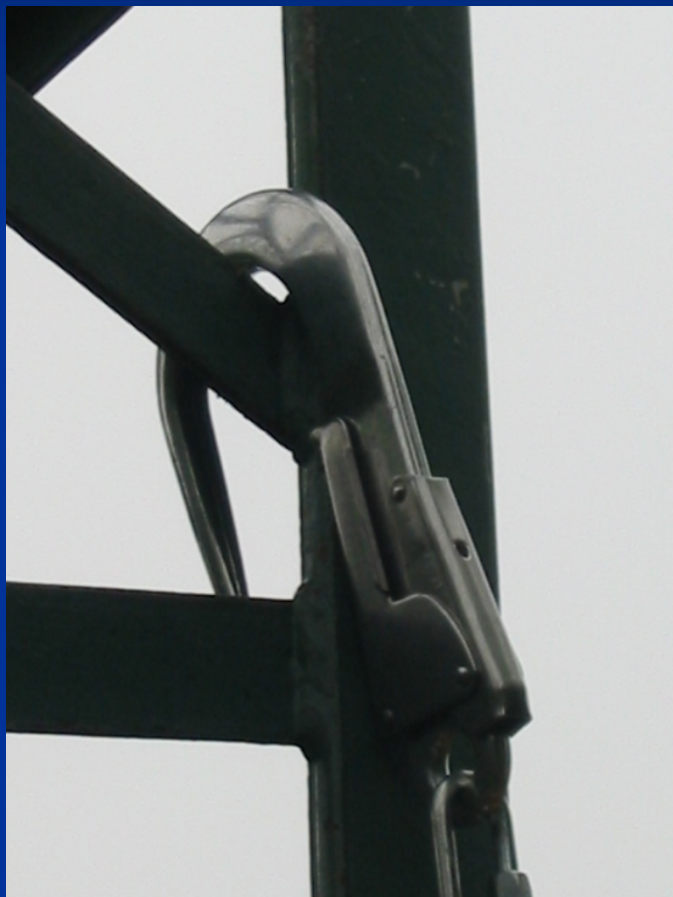
Scaffold open !