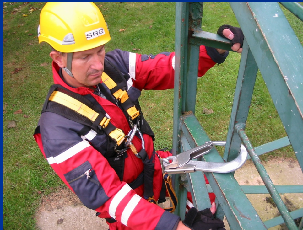
Attention! Load on the scaffold