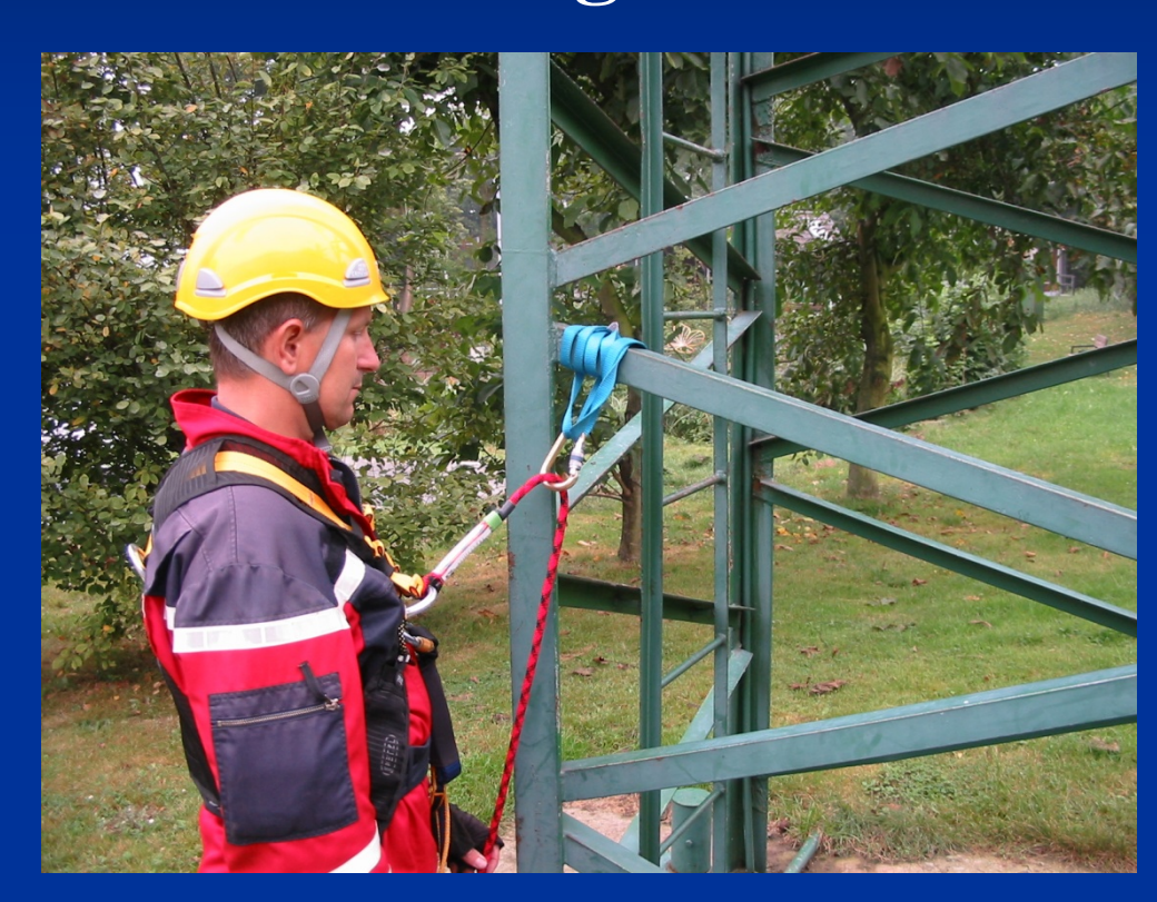
Slip of intermediate belay possible