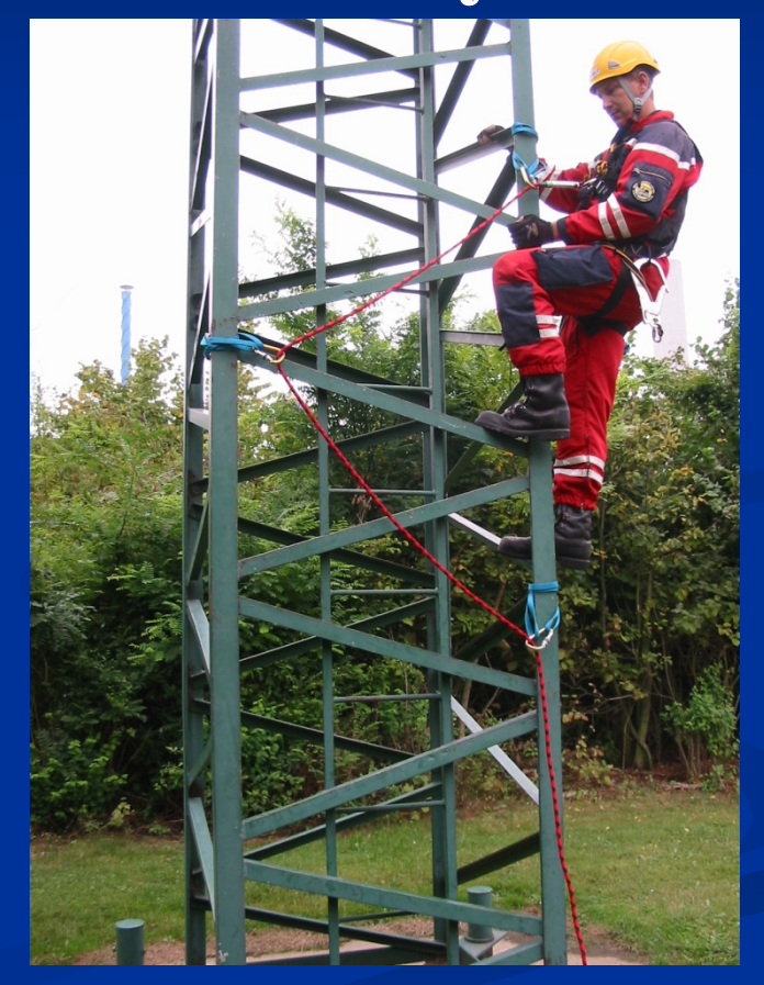
Keep the rope straight – reduce friction