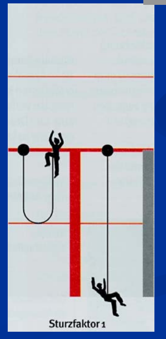
Fall factor 1