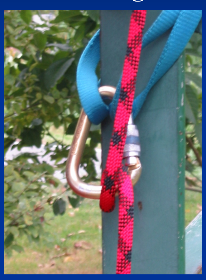
Rope guided wrong