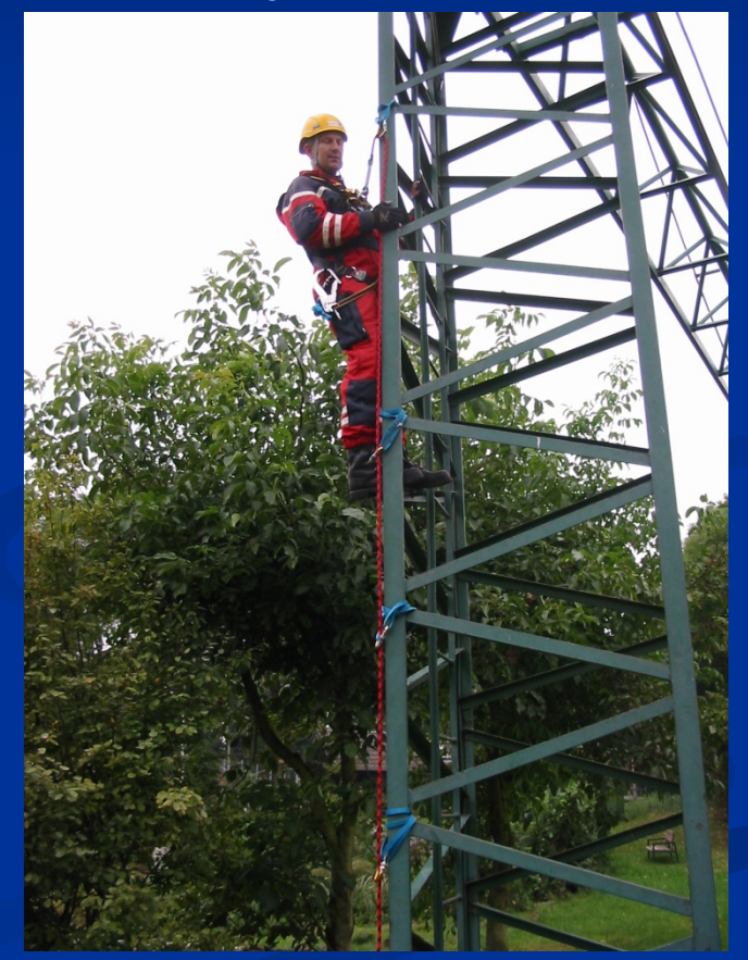
Larger distances far from the ground